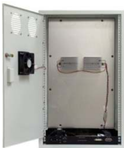
5030 Series Rear Access

These Air Baths have also been designed for ease of field maintenance through the use of modular components and sub-assemblies.